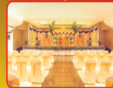
Thiru Banquet A/c

Hall Capacity: 500 pax A/C Dining Hall: 100 persons Rooms: 6 A/C Rooms Parking: 60 Cars