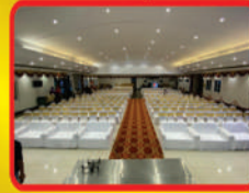
Sekar Banquet A/c

Hall Capacity: 1000 pax A/C Dining Hall: 150 persons Rooms: 8 A/C Rooms Parking: 80 Cars