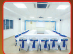
Nathan Conference Hall A/c

Seating Capacity: 80 pax Dining: 120 persons